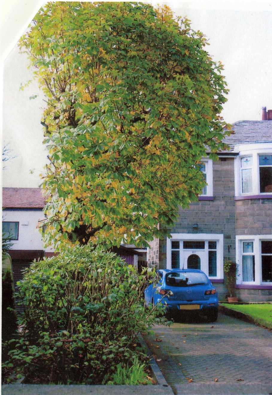
Tree T1 viewed from the pavement of Walmersley Road in Oct 2006 - after the pruning action. No 895 is to the left, and 897 to the right of the image.