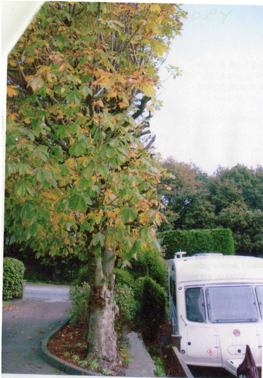
Tree T1 viewed from inside the boundary between] 897 (to the left) and 895 (with caravan to the right) looking back towards Walmersley Road. Photo taken after the pruning October 2006.